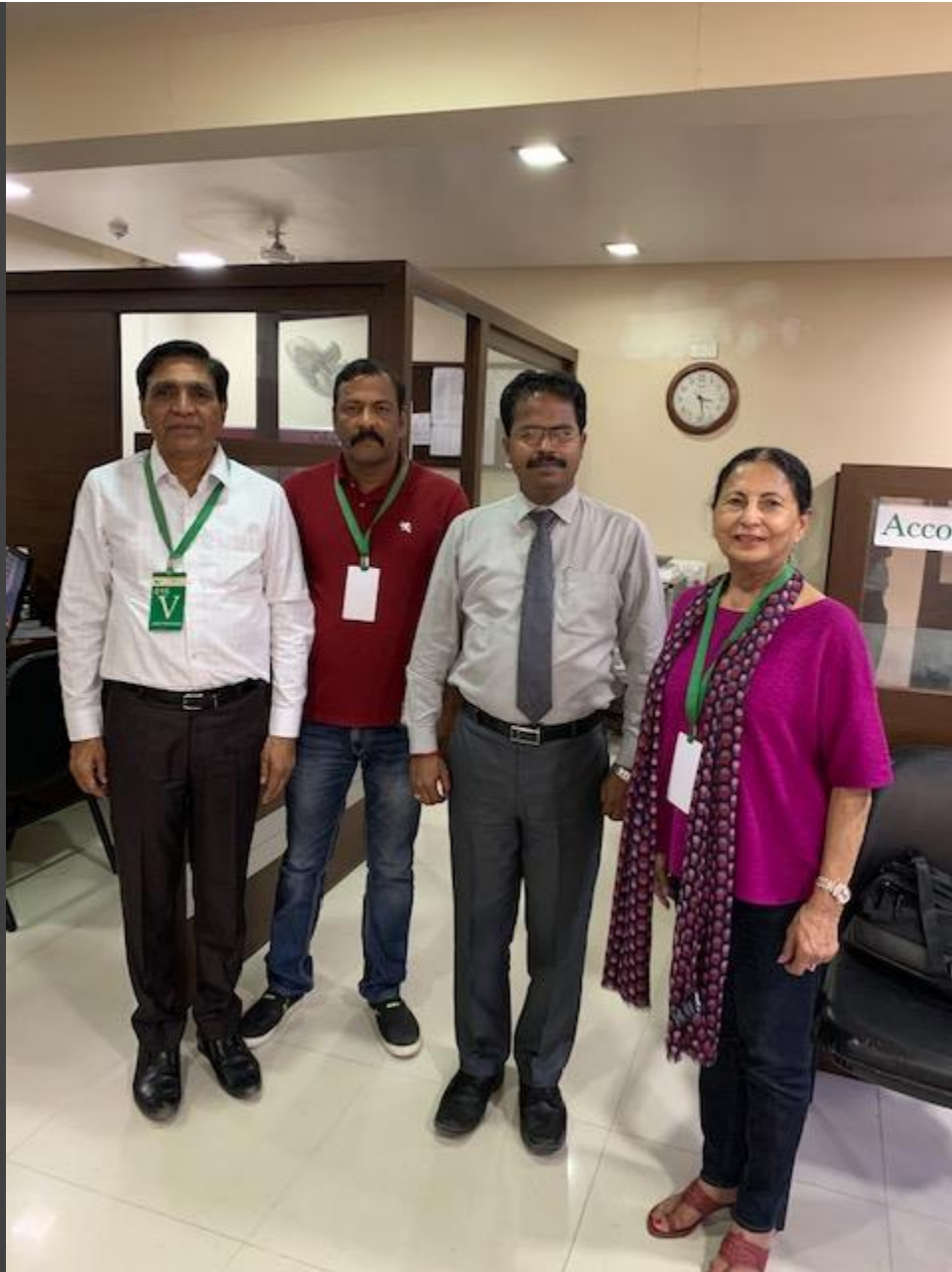
Principal and Board Members - Agakhan School Sidhpur.