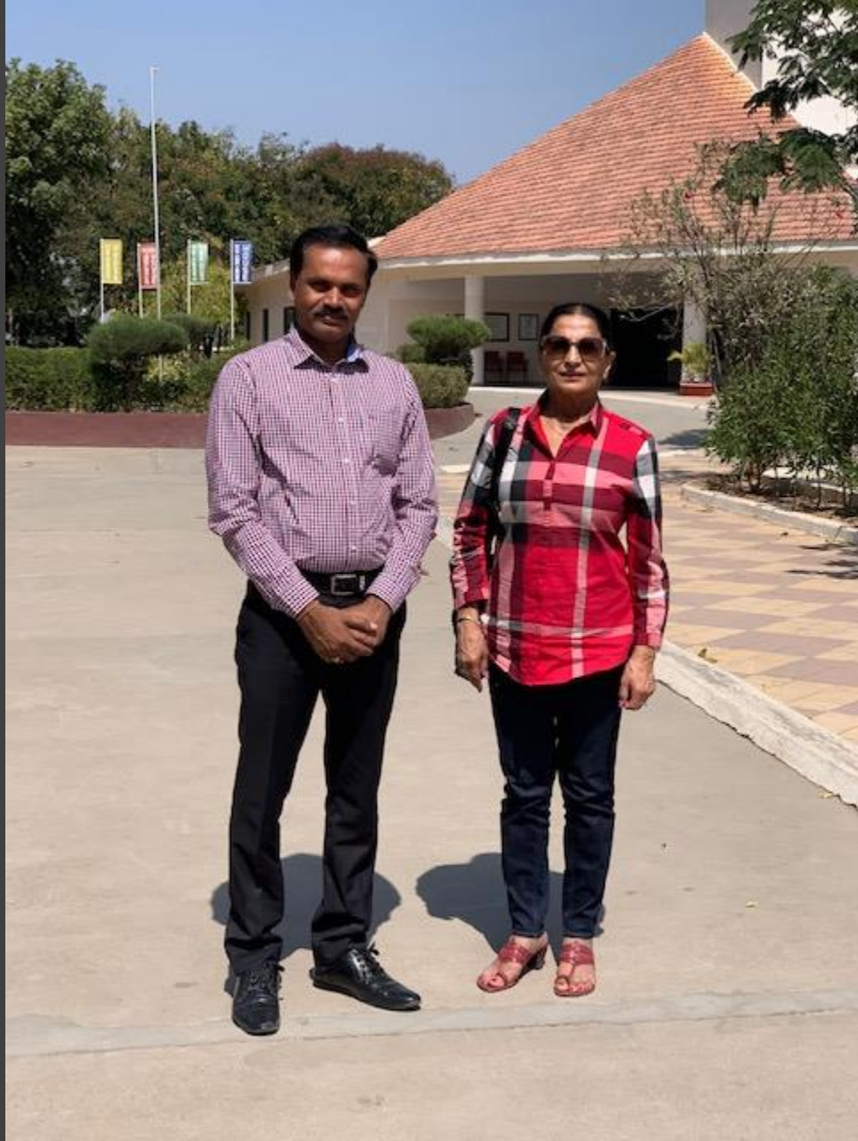
Principal, Mundra Agakhan School.