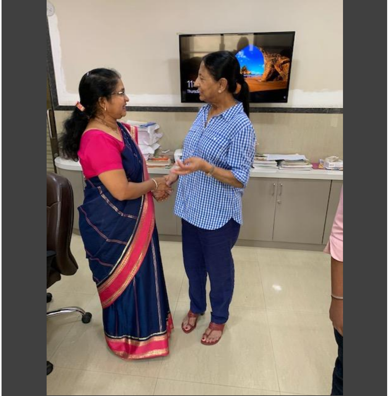
Principal, Agakhan Girls Academy Rajkot.