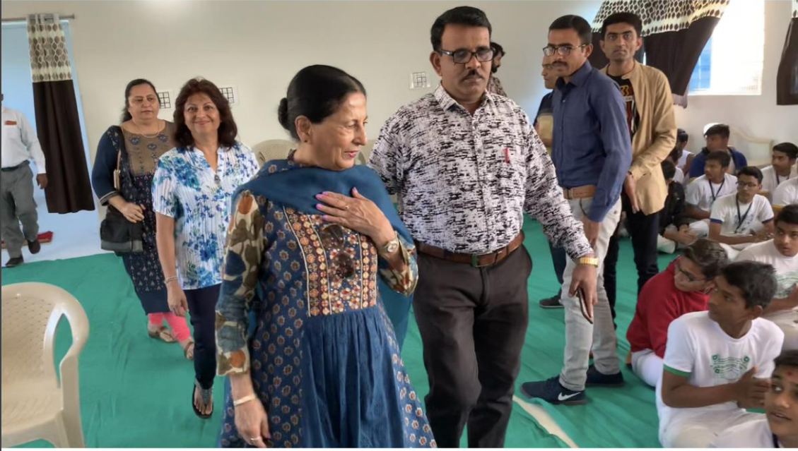
Principal, Maliya Hatina Agakhan School and Hostel.