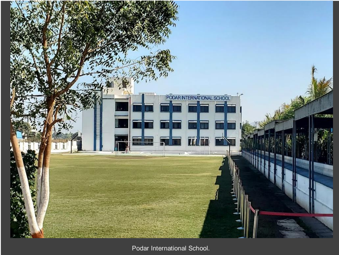
Podar International School.

We were very impressed with this school. The Principal showed us around and ensured that we met our children in the classroom. We will never forget one sentence he told us “you have brought the children from ultra-poor families. These families would never have been able to walk through this gate.” All we can say is Shukhar.