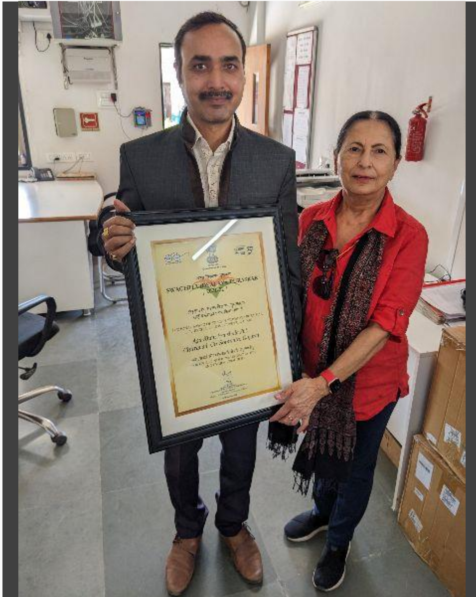
The Chitravad school principal is happy to share the award.